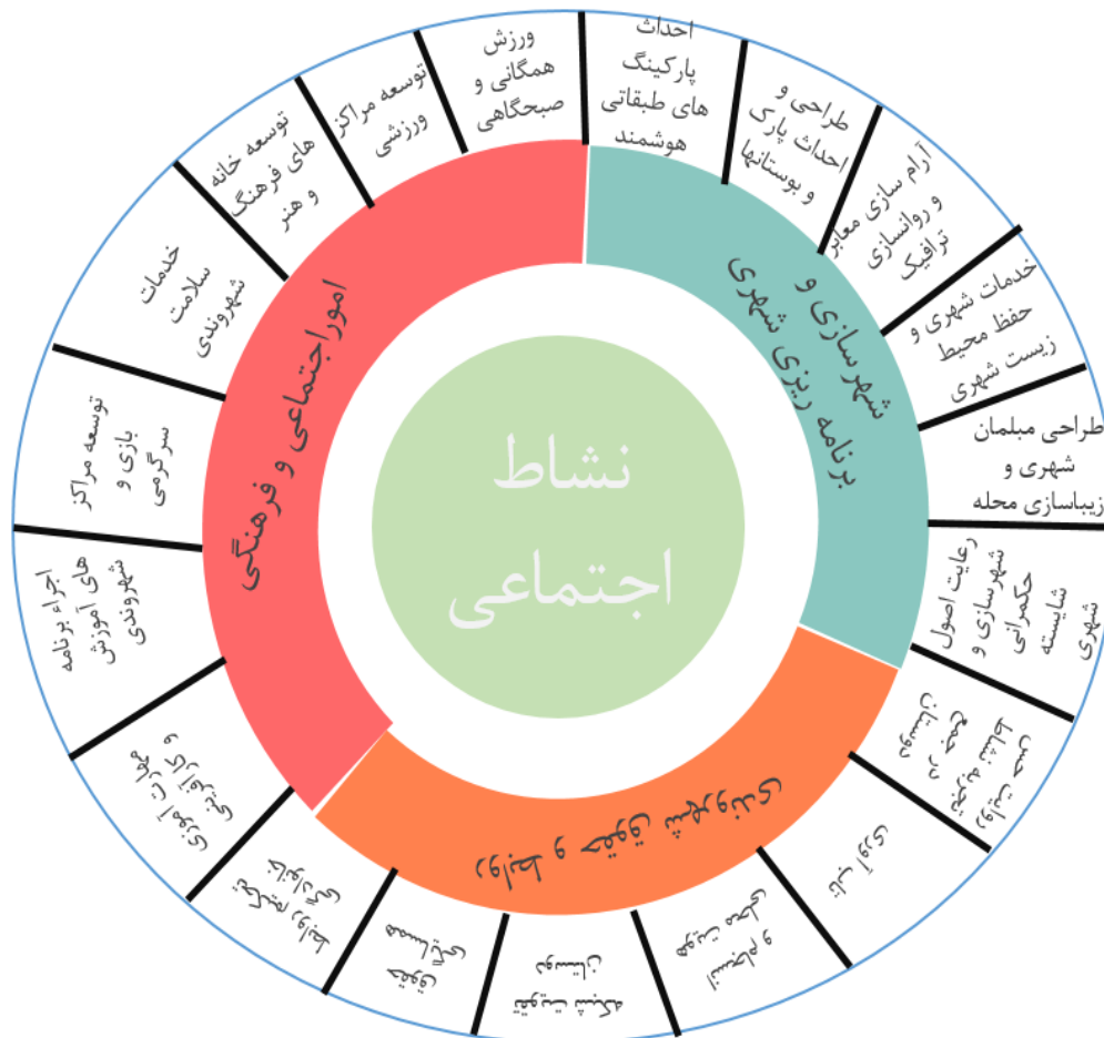
Figure 2. model for social vitality development by meta-synthesis approach

According to the above seven steps, Figure 2 shows a model for social vitality development by meta-synthesis approach.