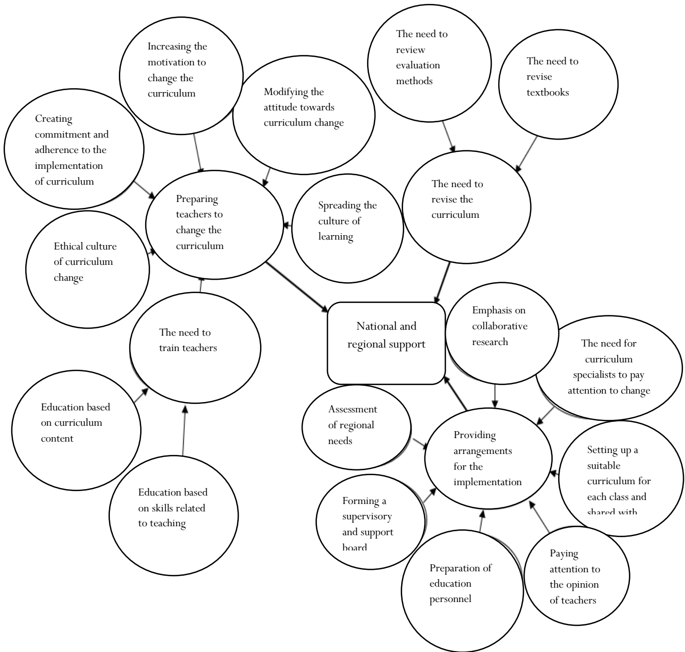
Figure3. Identified factors affecting educational reforms at the level of national and regional support for high school mathematics resulting from the combination of research synthesis and content analysis

In diagram 3, the identified factors affecting educational reforms at the level of national and regional support for secondary school mathematics resulting from the combination of research synthesis and content analysis were drawn.